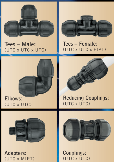
Tees – Male: (UTC x UTC x UTC)