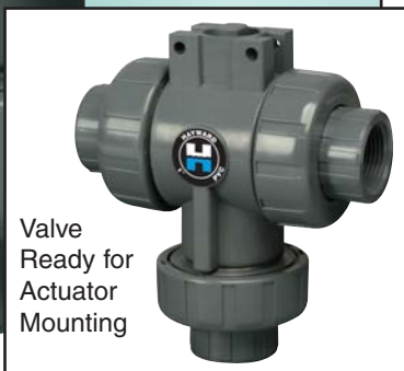
Valve Ready for Actuator Mounting