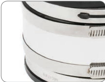
.012" (12mil) Stainless Steel Shield

The Ultimate RC - Engineered for resistance to heavy earth loads and shear forces, while providing improved pipe alignment.