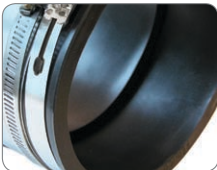
One Piece Molded-in Bushing Gaskets

Ultimate Transition Connections - For the transition connection of differing pipe sizes or materials, the 5000 Series gasket features a one piece molded-in bushing.