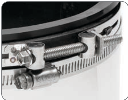
316 S.S. Nut and Bolt Clamps

Fernco RC Series Couplings offer the same product features and benefits and also meet ASTM C 1173, but come with 301 series stainless steel worm gear clamps.