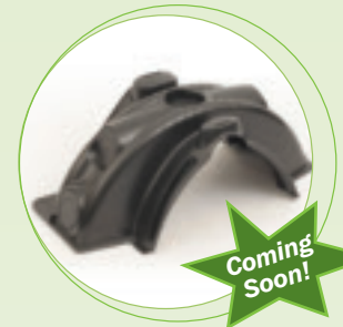
Side Port Coupler

ADS Service: ADS representatives are committed to providing you with the answers to all your questions, including specifications, and installation and more.