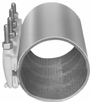
JCM 171 Universal Clamp Coupling Image reflects 12" width

JCM 100 Series Universal Clamp Couplings are ANSI/NSF Standard 61 Certified.