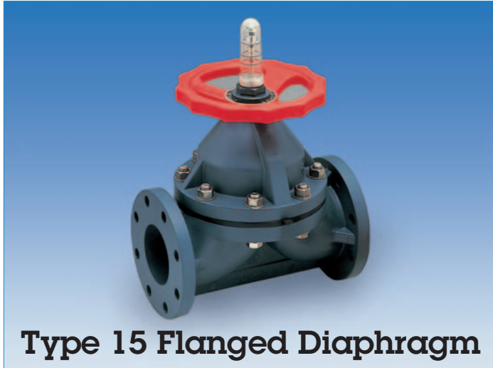
Type 15 Flanged Diaphragm